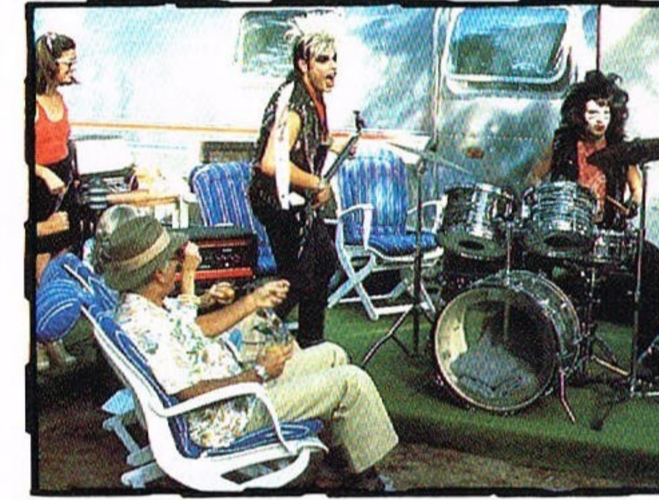
"Just a heavy metal summer... That's the spell you're falling under."