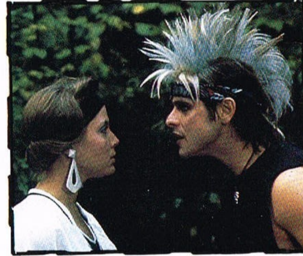
"Don't fight it babe. We were meant for each other. Dontcha' know?"