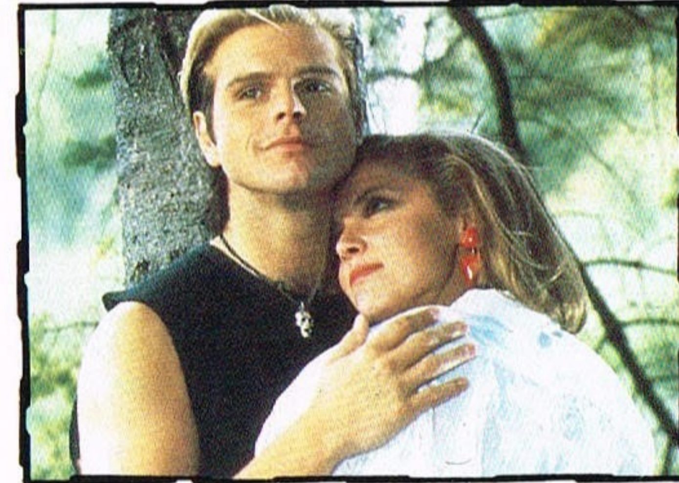
He's so good-looking without his heavy make-up ...She'd look so good in leathers and chains.