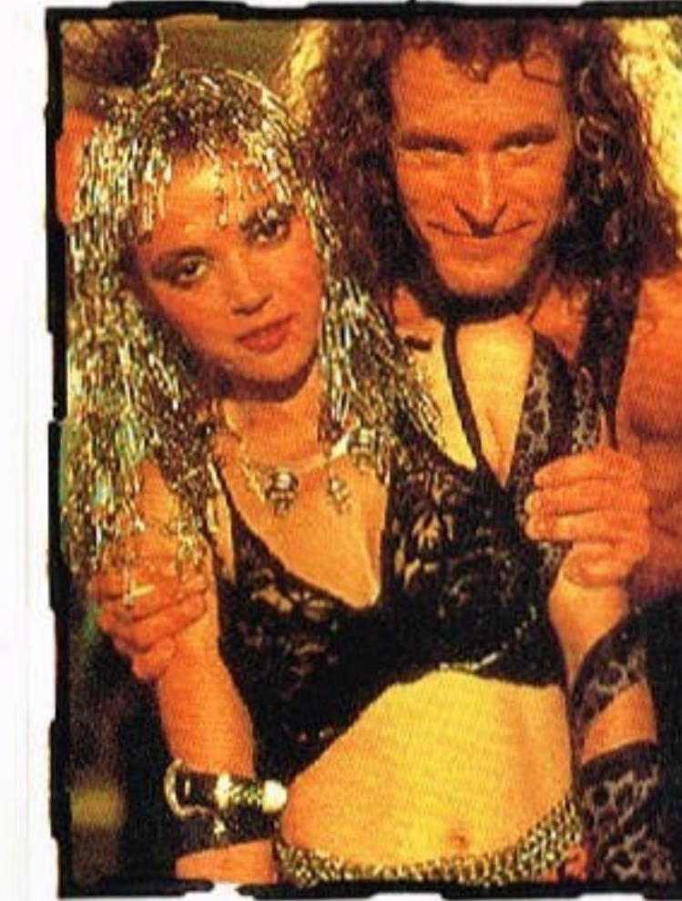
Who wouldn't when you get to jam with Ted Nugent.

Just a fun-loving gang of happy campers going wild in the wilderness. That's HEAVY METAL SUMMER! From the producers of MEATBALLS