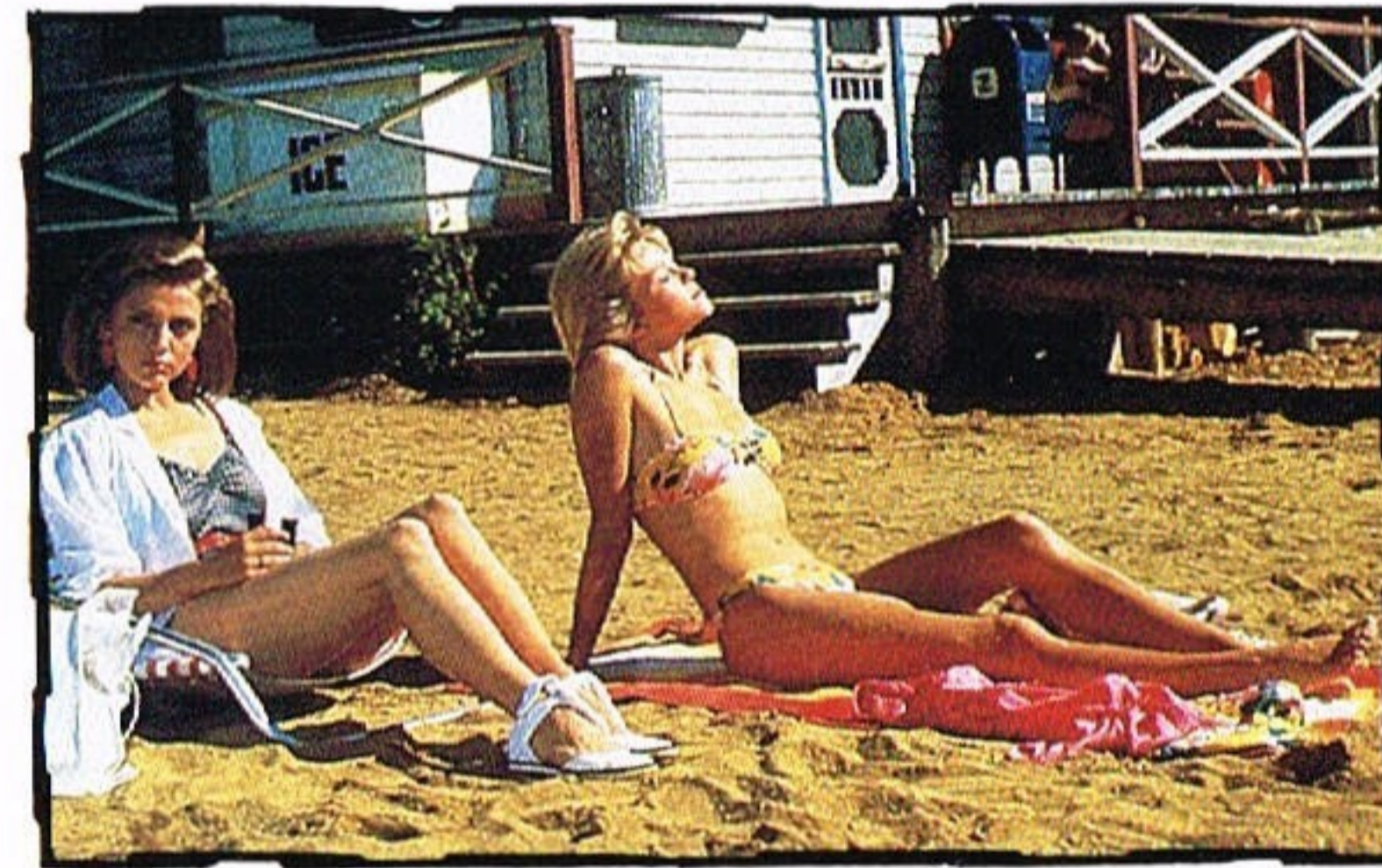
"Aren't there any good-looking hunks around here?"