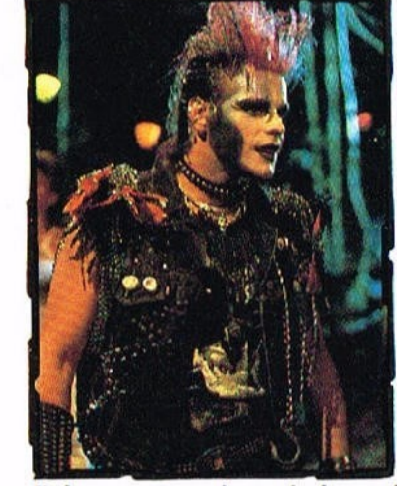
"Hey, wanna' rock 'n roll with a heavy metal man?"