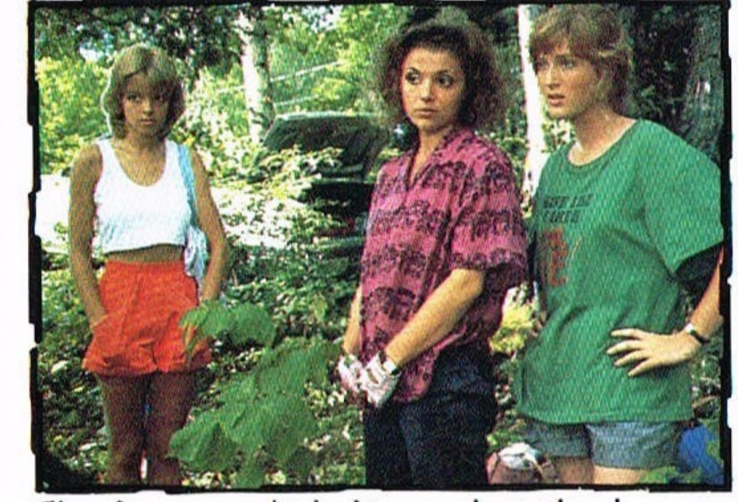
The foxes can't believe what they're seeing. These guys are wearing more make-up than Zsa Zsa Gabor.