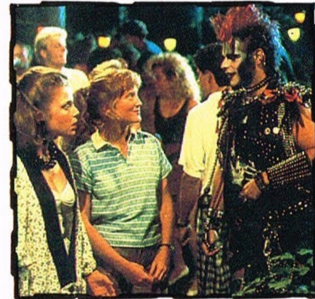
"Get it on with you? I'd rather die first!"