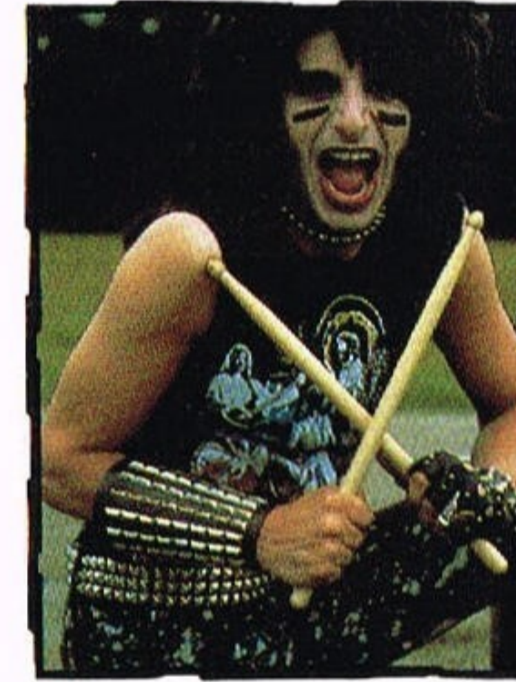
"Liven up! It's time for some rock 'n roll!"