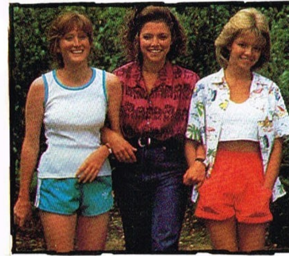
As nature loving city girls take a quiet stroll...