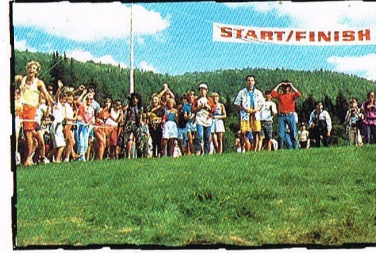
Are you ready for the wilderness challenge race?