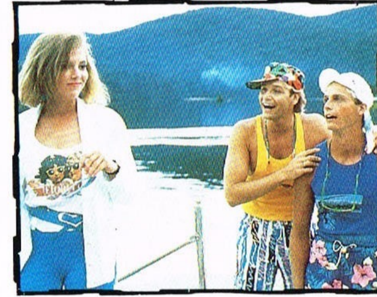
"Just my luck. Nerds. Nothing but nerds. Yuk!"