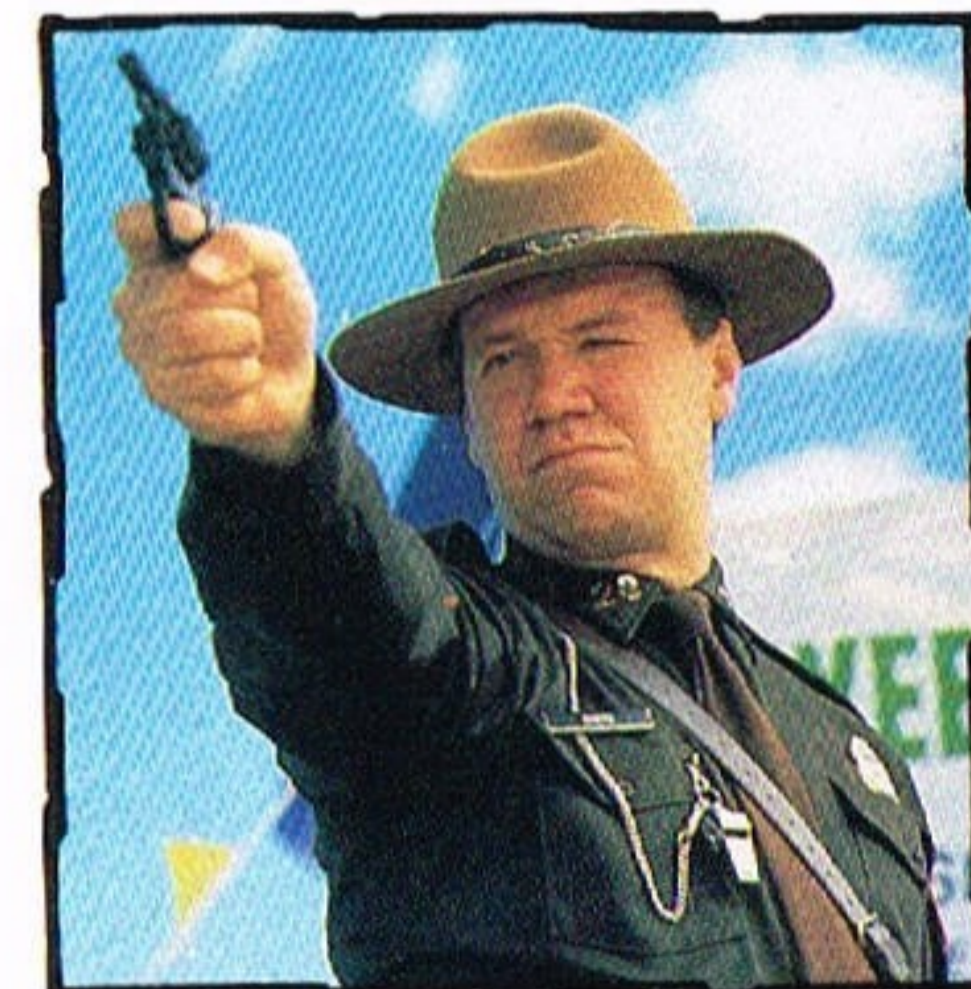
"They've dumped on me for the last time!" Meanwhile...