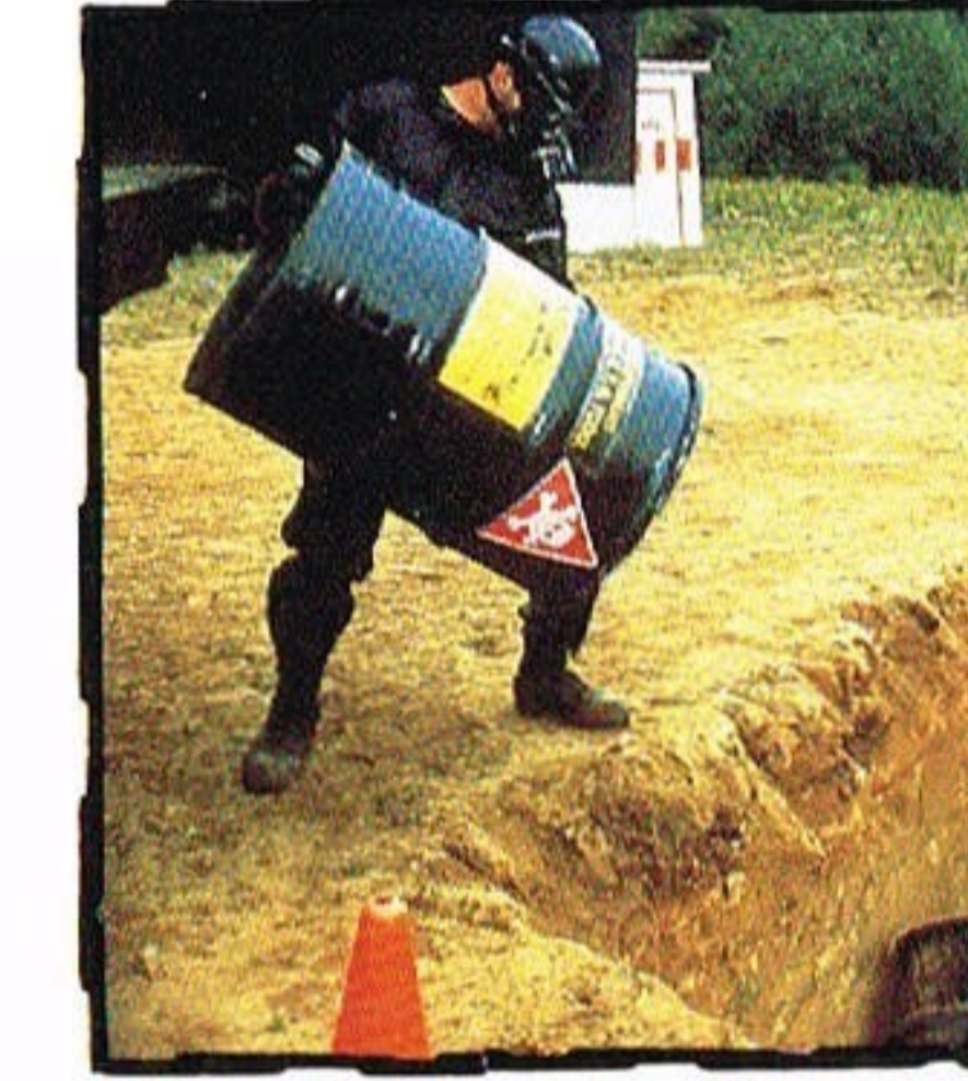
It's a big park. No one is going to notice a little toxic waste.