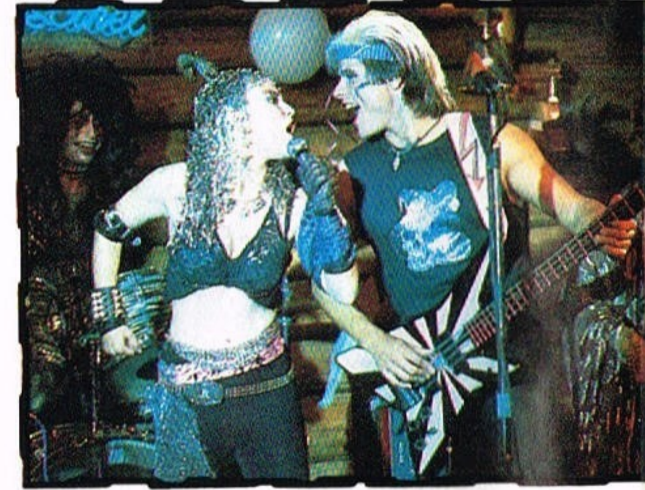
"I told you you'd learn to love heavy metal music if you gave it a chance."