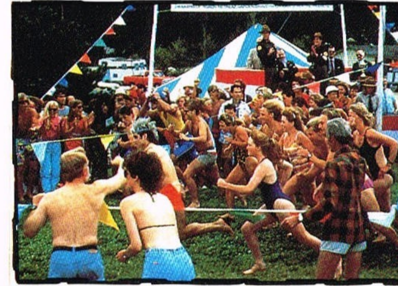
Which of these over-achievers will win the $15,000 prize?