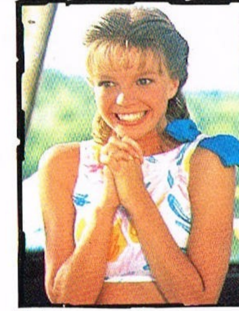
"Hot music! I hope they're rocking at the party tonight."