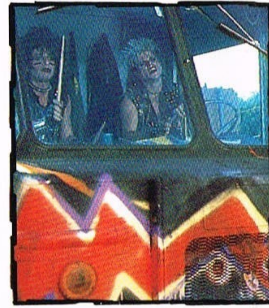
When some wild and wacky heavy metal rockers arrive on the scene.