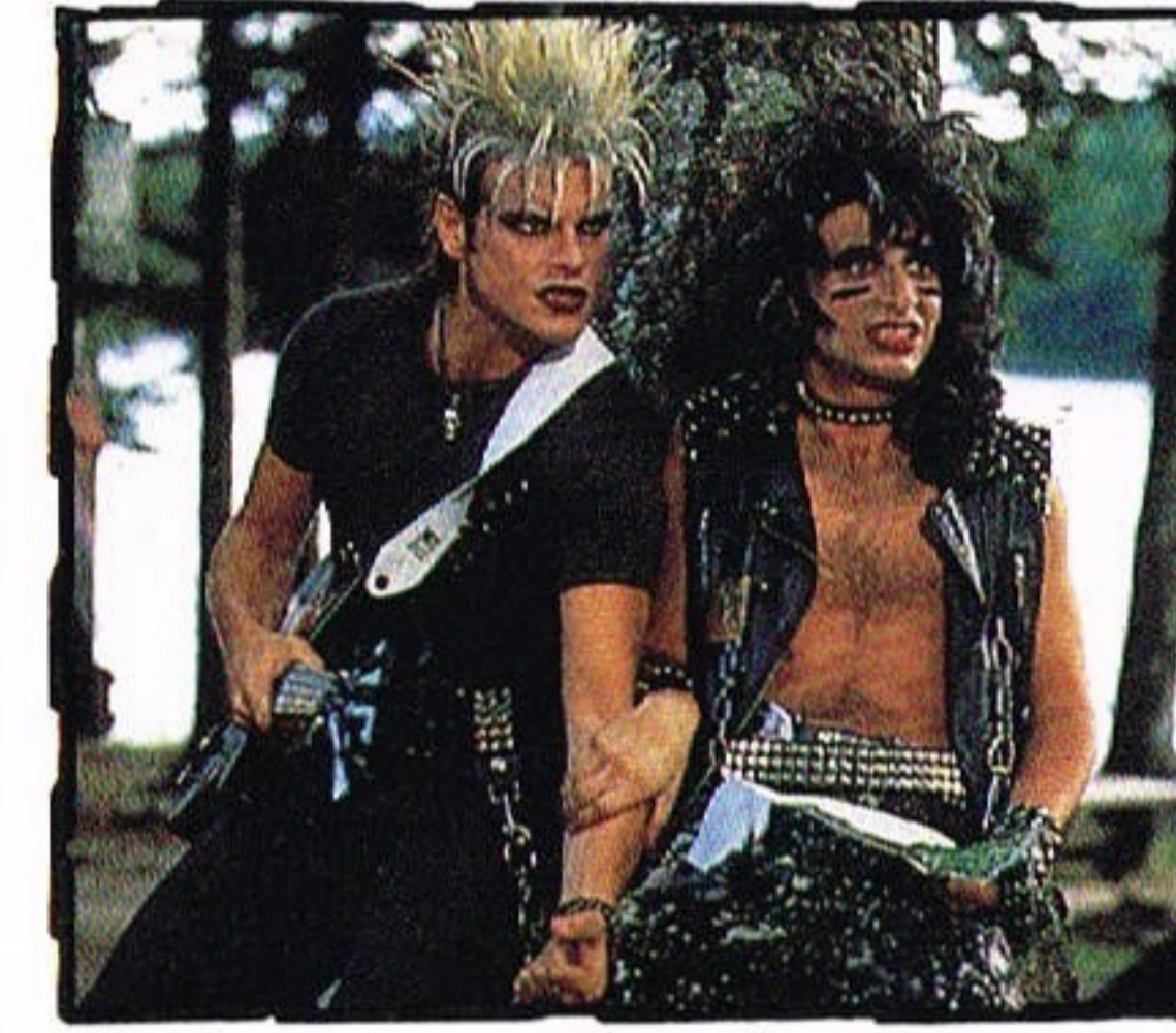
The heavy metal rockers are checking out the foxes.