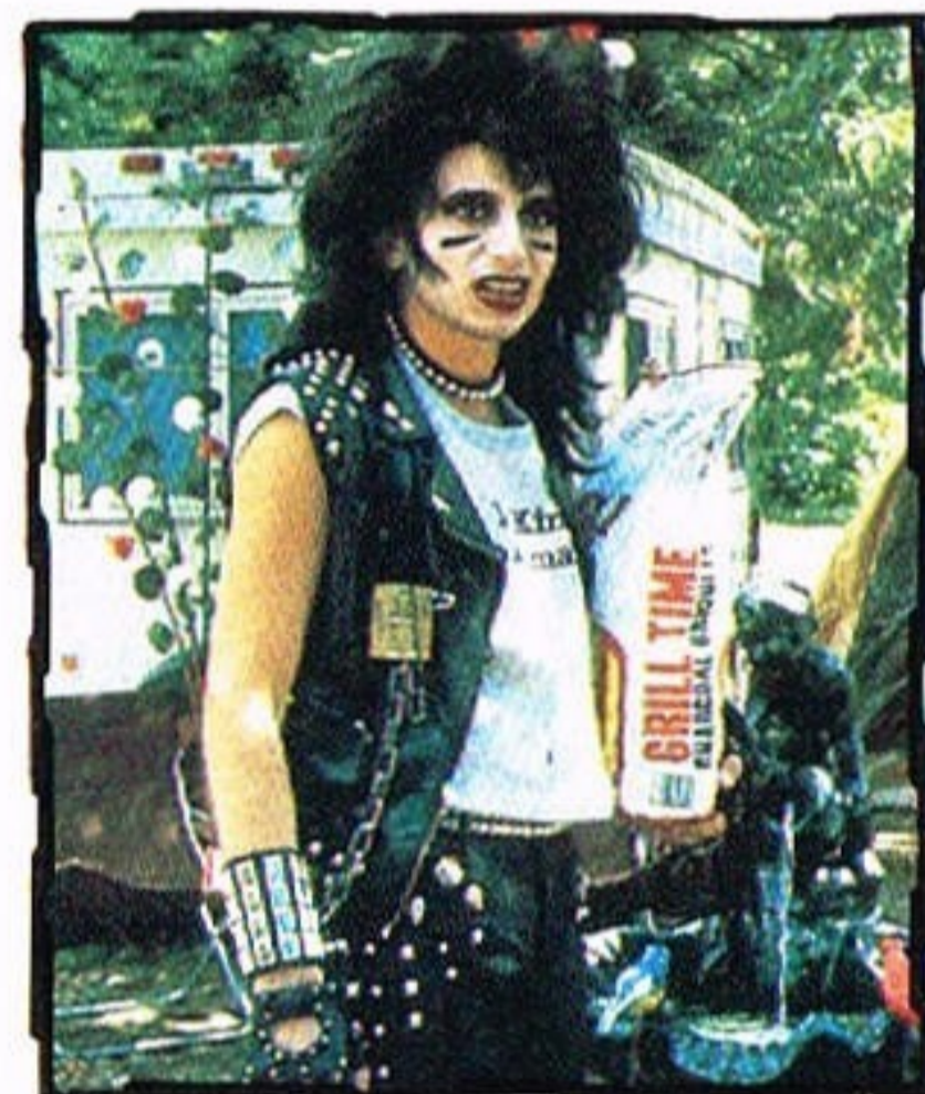
"What is this place? Zombieville? Man, it looks like the camp of the living dead."