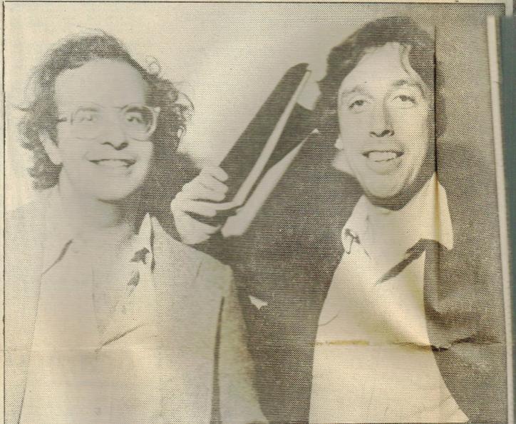
Meatballs director Ivan Reitman (right) and producer Dan Goldberg.