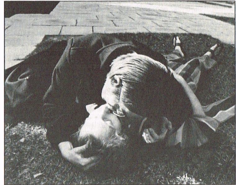
Crimes of the Future is marked by a pervasive homoeroticism

When I first saw Shivers (under its original title, The Parasite Murders ) at the Edinburgh Film Festival about ten years ago, the unanimous reaction among people I talked to was disgust. Edinburgh has traditionally been the left-wing film festival; it was dominated at that time by Screen magazine, who organized seminars that were right at the forefront of contemporary theory. We were still in the aftermath of May '68 and its related events over the Western world. Even "bourgeois humanists" like myself were beginning to become politicized and ideologically aware. We believed not only that a "liberated society" was possible, but even that it might be within sight. Now, a decade later, a few of us are still trying to cling on to a